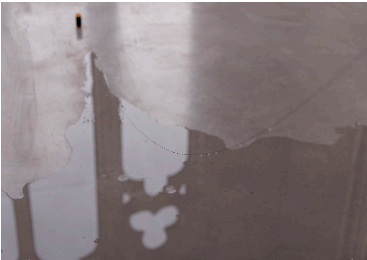
Ismail Bahri, Coulée douce . exhibition view, Les églises, Chelles, France, 2014.